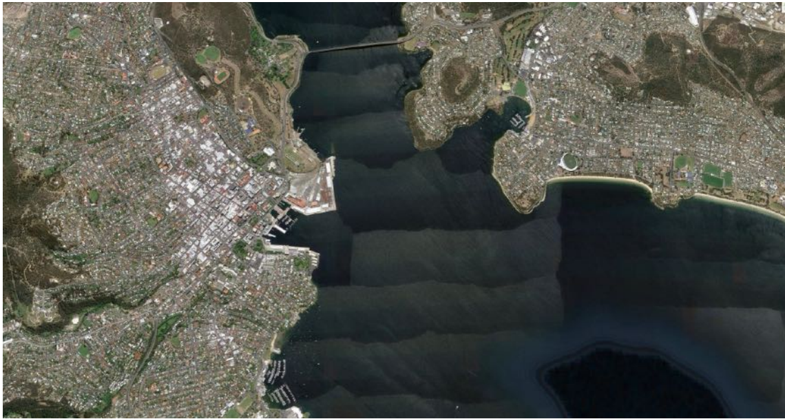
Figure 2: Hobart from above