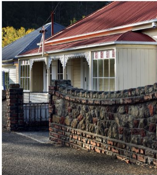
Figure 3: Hobart houses