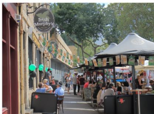
Figure 4: Attractions and activities